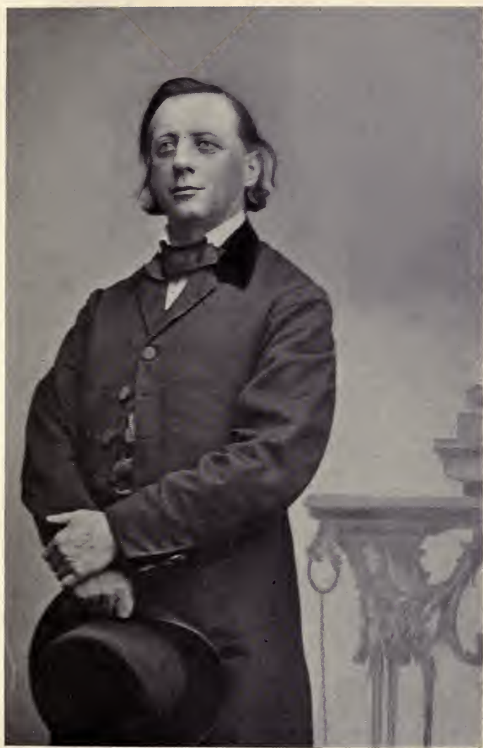
HENRY WARD BEECHER IN THE FIFTIES